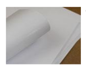
Coated paper Smooth and smooth, high smoothness, good gloss