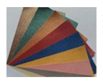
Specialty paper Has the special purpose, the output is relatively small