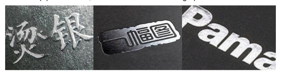
Hot stamping process

The process by which an object with a smooth surface becomes unsmooth, causing light to diffuse on the surface. The surface of the notebook after the abrasive process can enhance the anti-slip performance, but also can reduce the fingerprint residue.