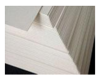
White cardboard Smooth surface, firm and thick, large quantity