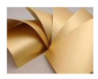
cardboard Waterproof, corrosion resistance, wear resistance, exquisite grade